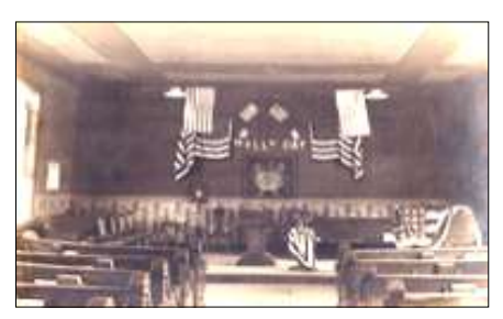
Bethel at Pearl & Cass Streets (1864)