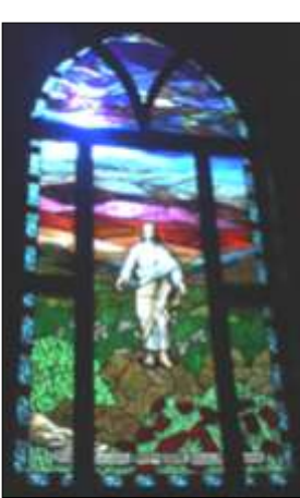
Jesus Stained Glass Windows were moved and re-installed at 206th & Cumberland Rd.

The third source for our present congregation was actually a mission congregation started by Bethel to serve the area southeast of Cicero. Before the Civil War, several Pennsylvania Ger-